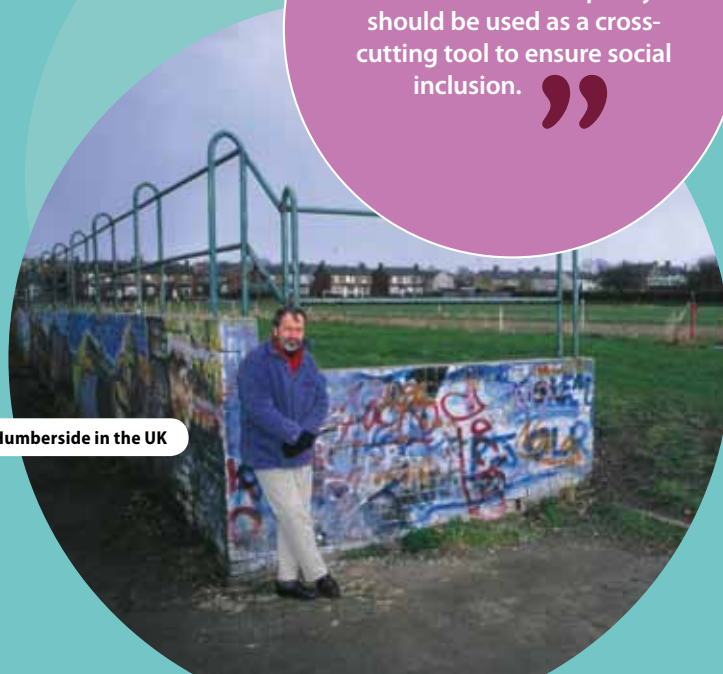
The Three Towns Initiative – regenerating parts of Yorkshire and Humberside in the UK

“ ...cohesion policy should be used as a cross-cutting tool to ensure social inclusion. ”