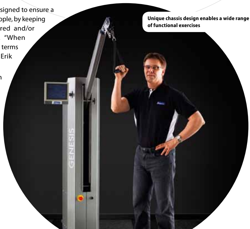
Unique chassis design enables a wide range of functional exercises