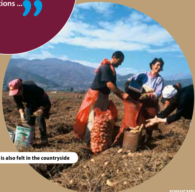
Exclusion is also felt in the countryside

“ ... a major advance in the improvement of the living conditions of disadvantaged populations ... ”