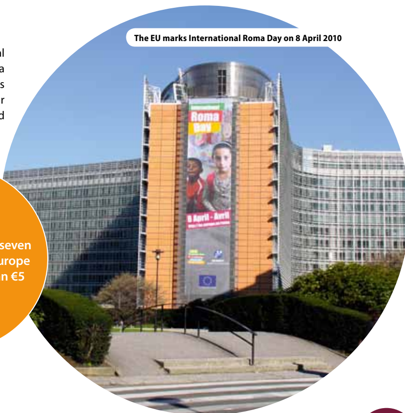
The EU marks International Roma Day on 8 April 2010

“ As many as seven million people in Europe survive on less than €5 a day ”