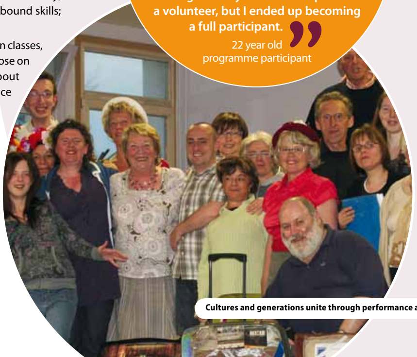
Cultures and generations unite through performance art